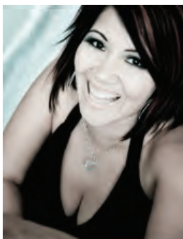
LATINO 96.3 Raq-C http://www.latin963.com