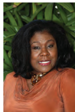
JEANNETTE HAWES OF THE EMOTIONS