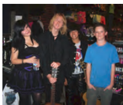
DORIAN'S ETERNAL YOUTH